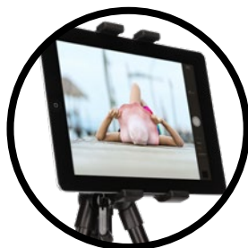
Tablet holder not included, Art.-No. 22640