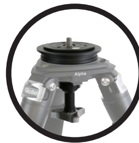
Bowl Adapter G-75 Ideal for balancing 3D ball heads, gimbals, panoramic and video heads. Not included (Item 22600).