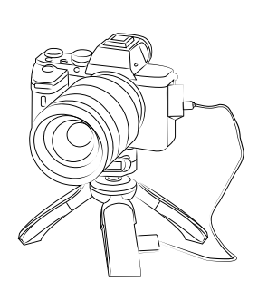
Attach a DSLM camera onto the tripod by using the 1/4 inch thread of your camera.

The tripod has a built-in power bank. This can be used to charge your camera or smartphone directly. Please note a corresponding cable to charge your device is not included