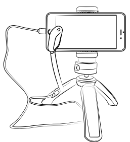
Furthermore you can connect the LED light within the USB slot of the tripod, to increase the light situation of your photo.