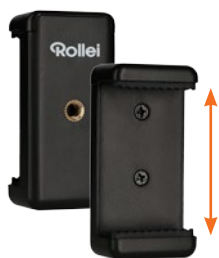
Smartphone Adapter for mobile phone width up to 8.5 cm