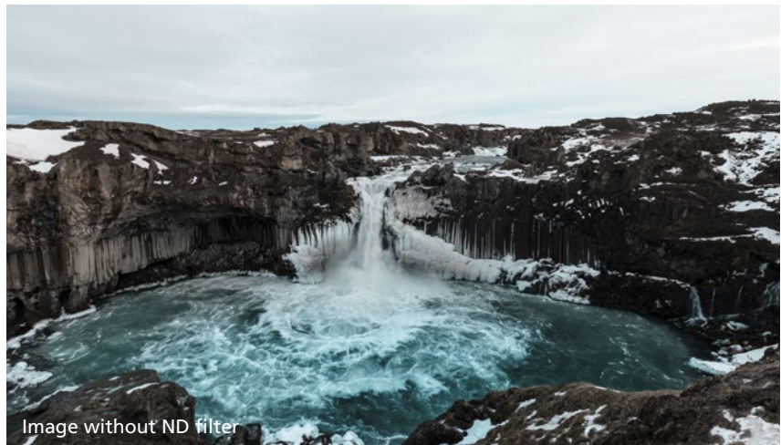
Image without ND filter