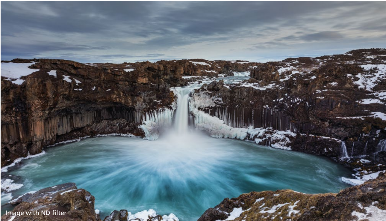
Image with ND filter