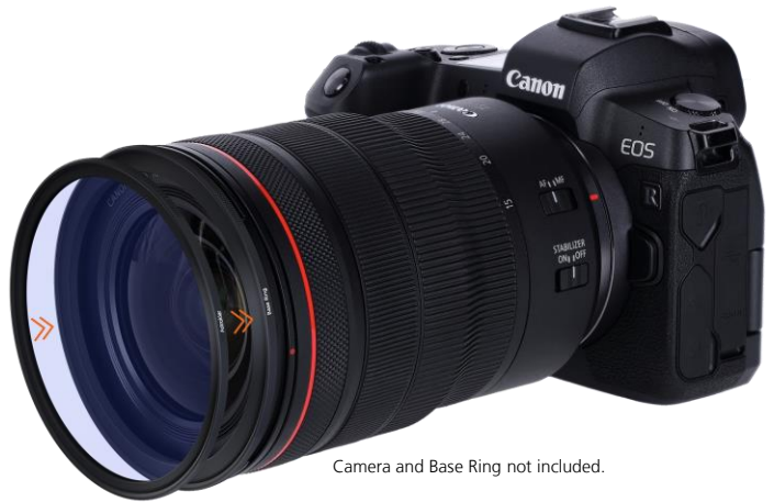
Camera and Base Ring not included.