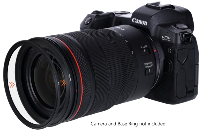
Camera and Base Ring not included.