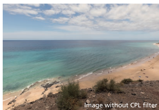
Image without CPL filter