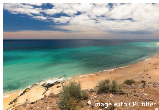
Image with CPL filter