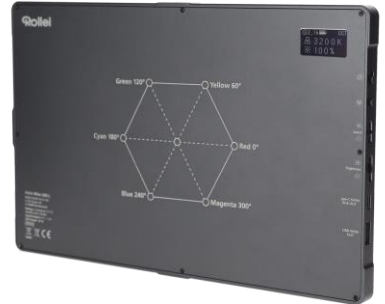
Tabletop Stand not included.