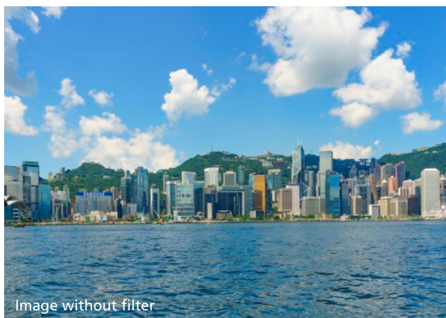
Image without filter