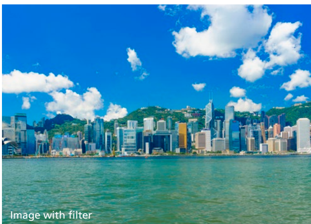
Image with filter